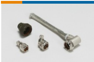
Ruggedized Backshells & Adapters (2821)